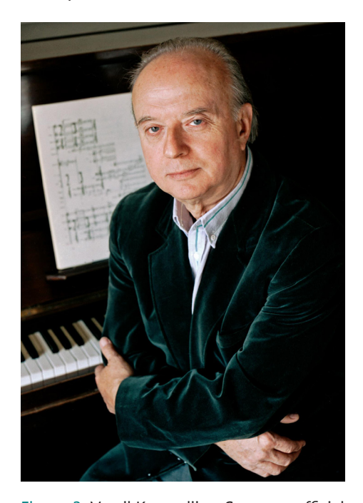
Figure 3. Vassil Kazandjiev.

"Pictures from Bulgaria" by Vassil Kazandjiev. The phenomenon of crossover conversation is evident in the symphonic suite "Pictures from Bulgaria" (1970), composed by Vassil Kazandjiev (b. 1934) (see Fig. 3). This is particularly noticeable in the sections titled "Peasant Song" and "Kukeri Dance" (9:54 and 14:26 in Figure 4). The first piece incorporates a theme derived from a well-known folklore motif found in the ballad